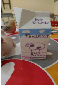
Awesome art work from the group!

We have continued to offer group activities to the Children and Young People and ASN sections nearly every month.